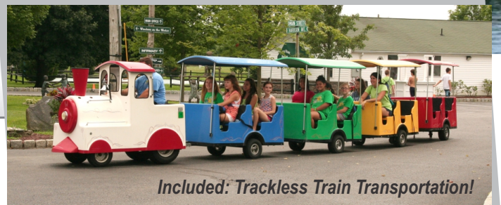
Included: Trackless Train Transportation!